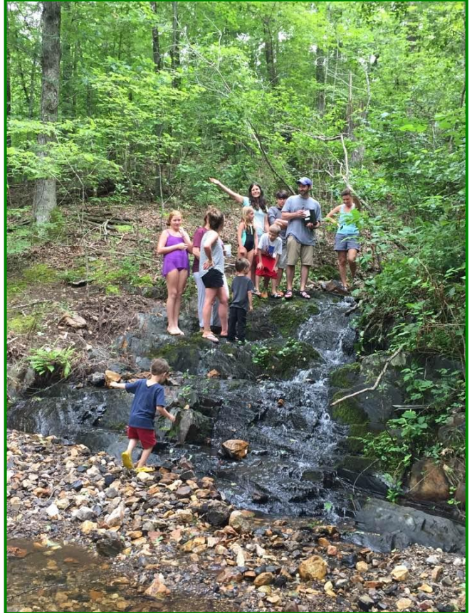
Special people; Special moments