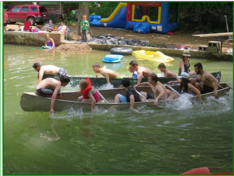
Special, quiet times; loud, exciting times - all memory-making times!